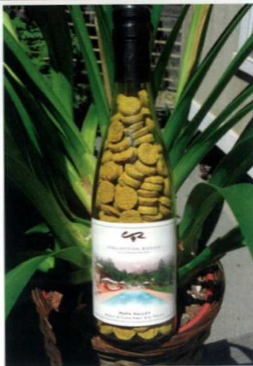
Top to Bottom: Interlaken Resort, Hotel Telluride; Castiloga Ranch pet offerings