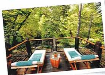
BEST OF NAPA From top: The Michelin three-starred Restaurant at Meadowood; Redd's selection of cold foie gras; the spa deck at Calistoga Ranch.