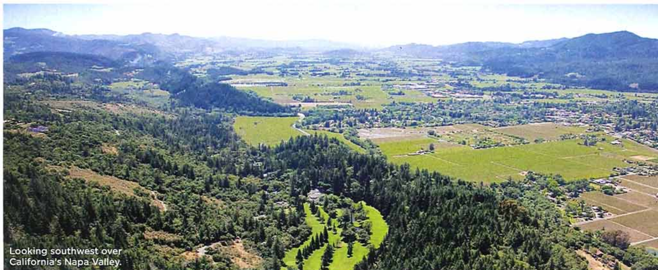
Looking southwest over California's Napa Valley.